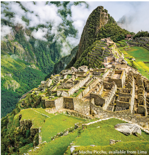
Machu Picchu, available from Lima