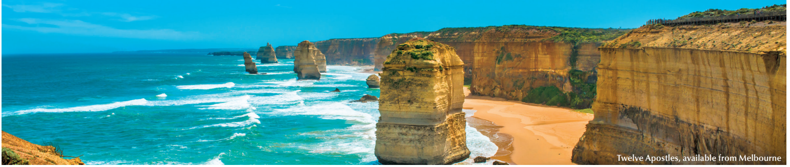
Twelve Apostles, available from Melbourne