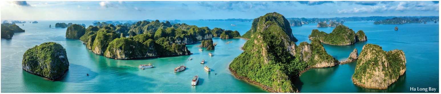
Ha Long Bay