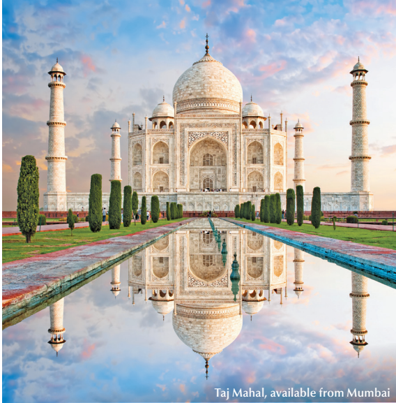
Taj Mahal, available from Mumbai