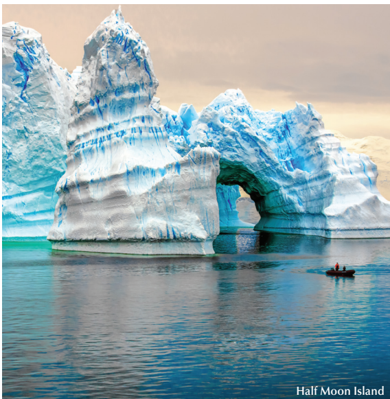
Half Moon Island

The first of its kind, this ultimate odyssey transcends the imagination as it explores three continents on two small, luxurious ships linked by an amazing, immersive Mid-Cruise Overland Program. Gain an extraordinary global perspective on this eclectic journey that stretches from great cities Down Under to Ushuaia, the city at the end of the world, and staggeringly beautiful lands of Patagonia and Antarctica.